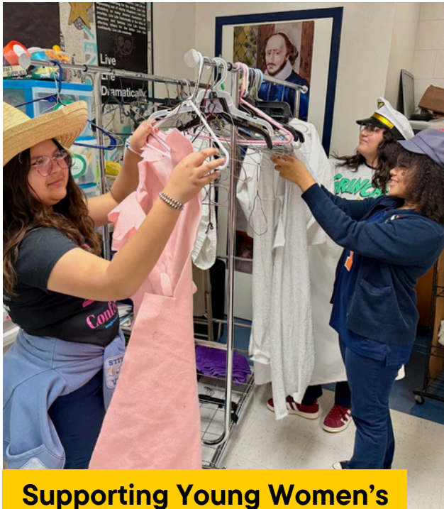
Supporting Young Women's Leadership Academy's theater program

“Thanks to the generous support of Freeport-McMoRan, our theater students now have access to upgraded technology and lighting that elevates their learning and performance experience. This investment gives our students hands-on opportunities to understand the full scope of theater production and grow as artists and leaders. We are deeply grateful for this partnership and proud to be part of a community that believes in our students' potential.”