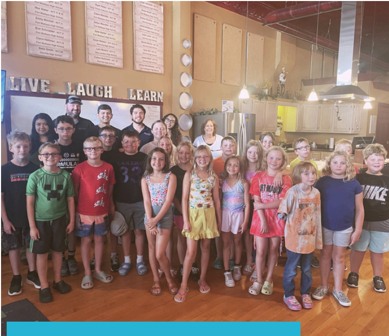
Mining for Knowledge Camp with the YMCA

“ The activities were not only educational but highly entertaining and presented in a way that was fun and engaging the entire time. We are deeply impressed with the level of professionalism, patience and kindness the team at Climax Molybdenum showed us while they were working with our kids. ”