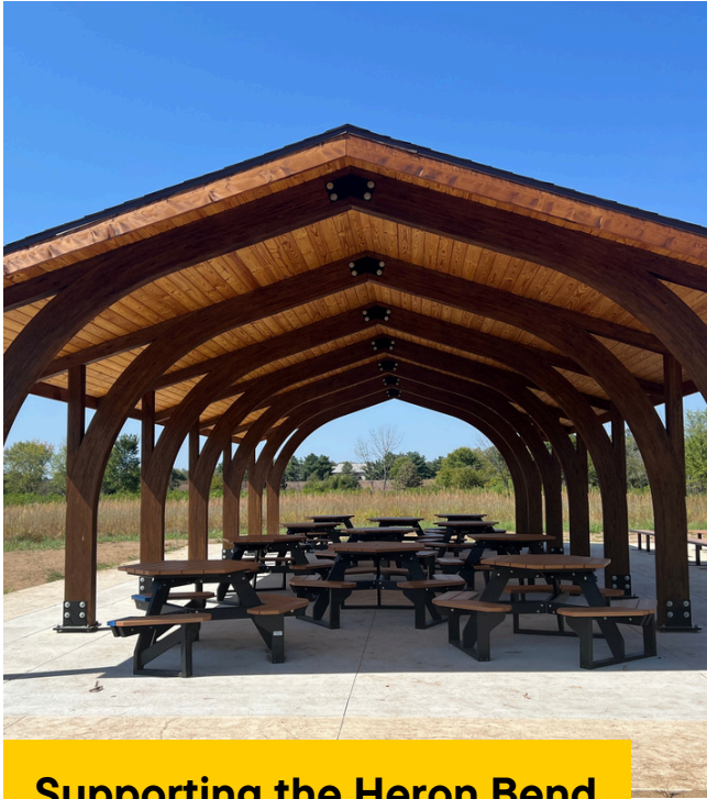
Supporting the Heron Bend Outdoor Classroom project

“ We’re incredibly proud of this project and the community support that helped make it possible. The outdoor classroom will serve as a welcoming place for education, exploration, and gathering, and we can’t wait to see how it enriches the lives of those who visit. ”