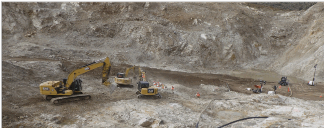
Sycamore TSF Project - Starter Dam Foundation and Fill Area